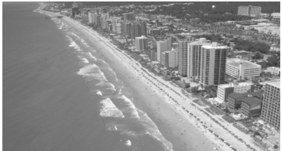
Myrtle Beach, SC — A Seaside Resort at the Heart of the Grand Strand.

On behalf of the 2005 Local Arrangement Committee it is my pleasure to invite you to ACPA's 62nd Annual Meeting to be held April 4-9, 2005 at the Kingston Plantation in Myrtle Beach, South Carolina. Myrtle Beach is a beautiful seaside resort located in the heart of the 60 mile coastline known as the Grand Strand. It is home to over 120 golf courses, several of which are ranked top in the country. Flying to Myrtle Beach is quick and effortless with many well-known carriers including AirTran, ASA/Delta/Comair, Continental, Spirit, Northwest, Vacation Express, USAirways, and the lesser known Myrtle Beach's own Hooters Air!